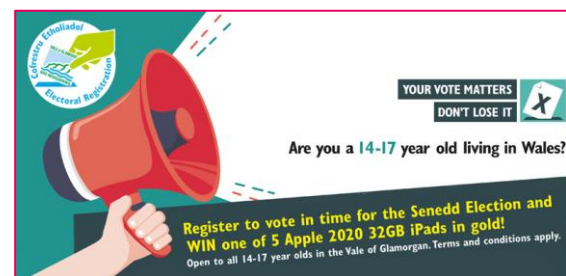
Figure 1. Local voter registration campaign with iPad competition in Vale of Glamorgan

Local councils, too, played a key role in welcoming young people to the vote, but they took different approaches to it, giving young people different experiences depending on the area they lived in. While the Vale of Glamorgan launched an iPad competition to motivate young people to register to vote, other local councils sent letters to all young people. In a number of local areas, however, focus group participants report having received no specific information on registering to vote at all.