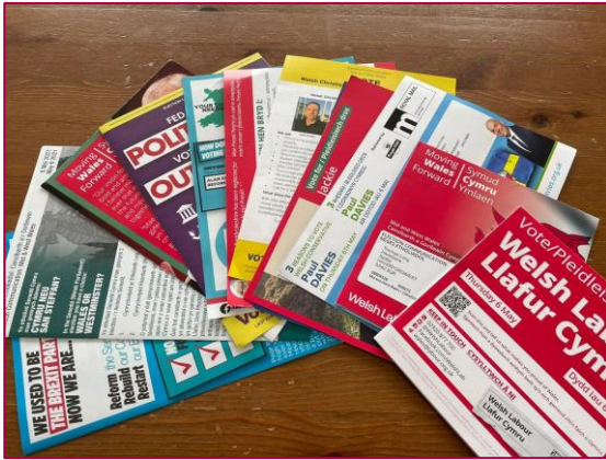
Figure 2. A young person's election diary entry showing campaign leaflets

Perceptions of the quality and reach of the campaigns among young people varied between political parties, especially in relation to young people's political interests. Among focus group participants, Plaid Cymru and, to a lesser extent, Welsh Labour were viewed as having engaged to the most extent with young people and engaged with their issues when compared with other political parties. Particularly in Welsh-speaking areas such as Gwynedd, focus group participants perceived candidates, predominantly those of Plaid Cymru, as more interested in young people's opinions than elsewhere.