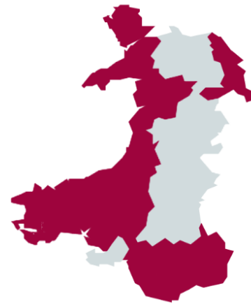
Figure 4. Map showing the where in Wales focus group participants are from (by NUTS-3-level)

With a view to working with a diverse group of young people from across Wales, 86 young people were recruited to participate in the research through secondary schools, further education colleges as well as through youth groups and youth workers in selected areas: Gwynedd and Anglesey, Pembrokeshire, Wrexham, South Wales Central, including Cardiff, and Carmarthenshire. Few young people joined the research from other areas after hearing about it from parents or friends. The participants represent diverse groups of young people – the majority aged 16 and 17, with few slightly younger or slightly older – from a mix of geographical locations across Wales, including young people from rural and coastal communities, from minority ethnic backgrounds, from Welsh-medium schools, and from predominantly Welsh-speaking areas (see Figure 4).